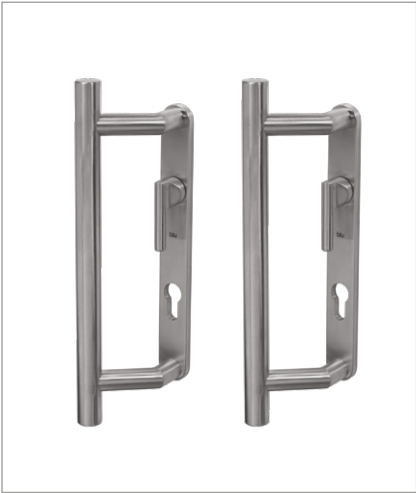
SSS Satin Stainless Steel