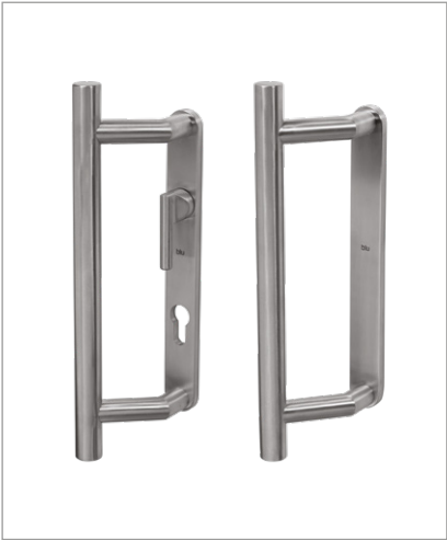
SSS Satin Stainless Steel