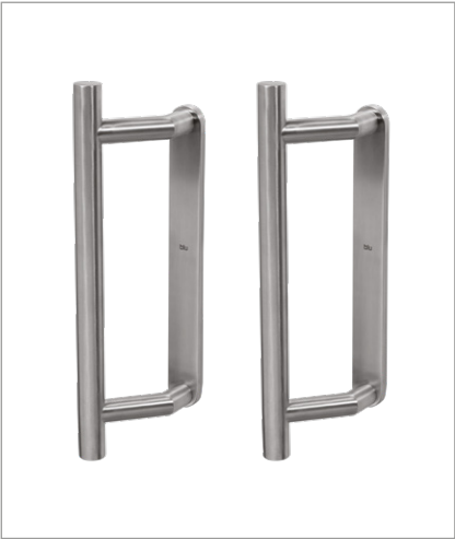
SSS Satin Stainless Steel

Visit www.coastal-group.com for CAD drawings