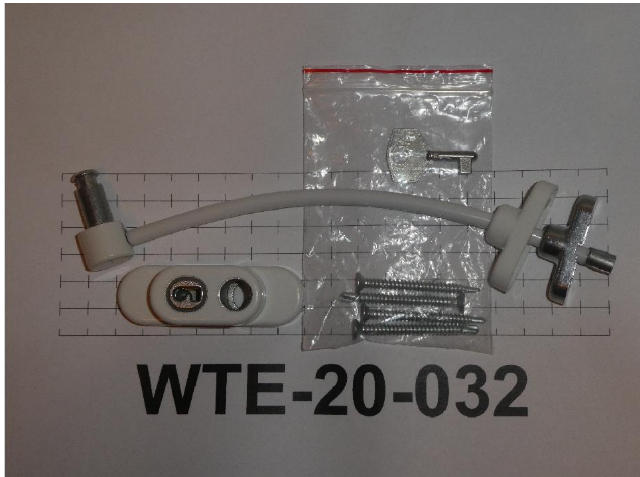
TSS Window Restrictor